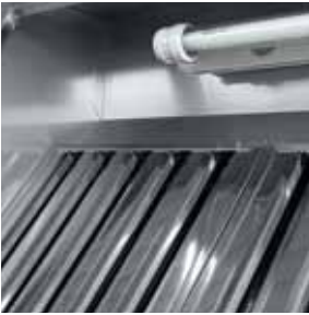
Detail of labyrinth filter