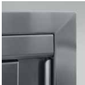
Detail of upper welded corners