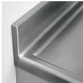
Detail of riser closed from rear