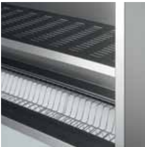
Detail of dish drainer with perforated shelf