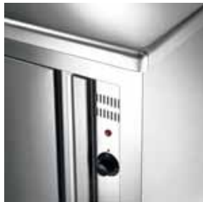
Detail of heated cabinet