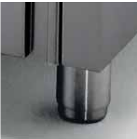
Detail of stainless steel foot