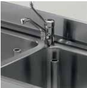
Detail of single-hole lever-controlled water assembly