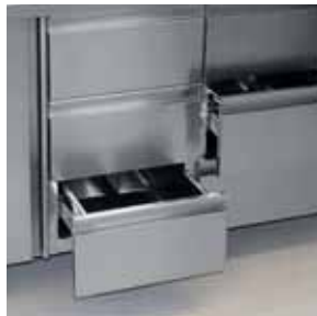
Detail of drawer unit