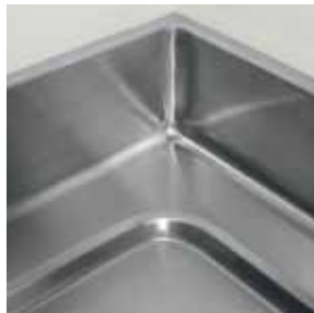
Detail of inset