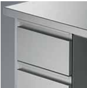
Detail of drawer unit