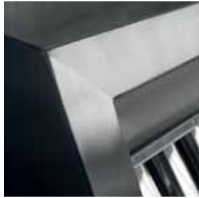
Detail of welded corners