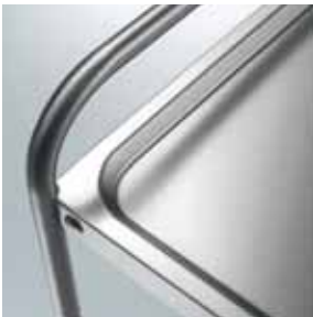
Detail of cart