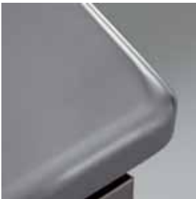
Detail of curved top