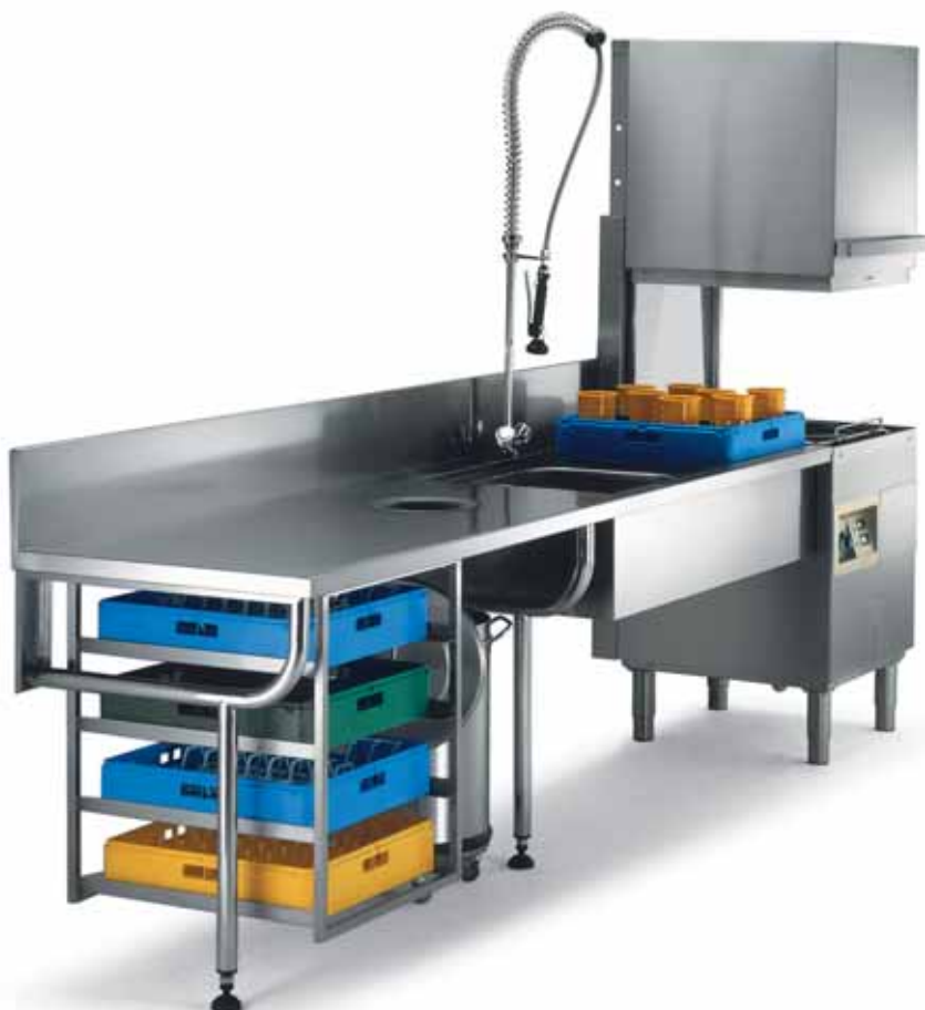
Detail of entry table